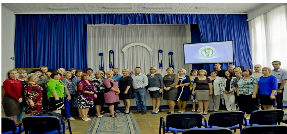
Photo – Training of social workers in early detection, prevention and rehabilitation of elders with dementia and severe cognitive impairment